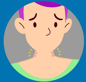
Swollen lymph nodes