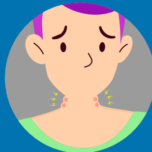
Swollen lymph nodes