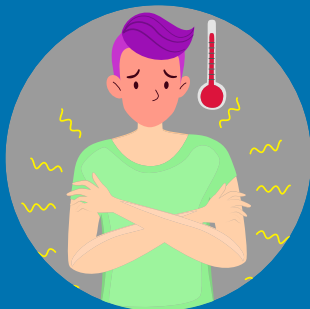
Fever or chills