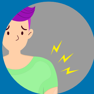
Muscle aches & pains