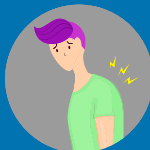
Fatigue and back pain